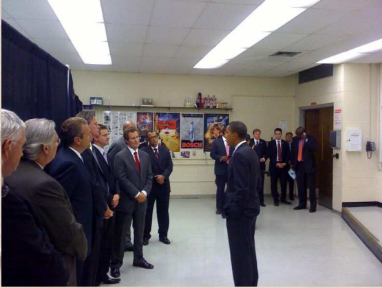
07/14/09 President Obama addressing our group after meeting us each personally. When the President left, we went to our seats for his speech.