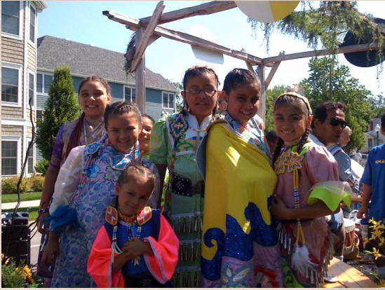
Some of our talented youth that participated as dancers during this year's Cherry Royale Parade. They did a great job!!