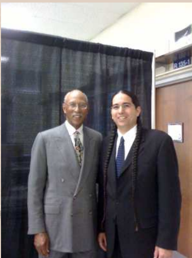
Introductions were also made to the new Mayor of Detroit, Dave Bing.