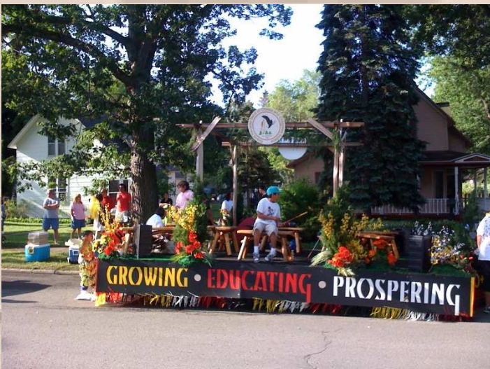
07/11/09 Cherry Royale Parade, part of the National Cherry Festival. Pictured above is the GTB Government Float.

The National Cherry Festival was a great time, as always each and every year, and the Grand Traverse Band is proud to be the sponsor for Heritage Day (which I covered in last week's email blast). We also entered two floats in the Cherry Royale Parade, one for the Tribal Government and the other for Grand Traverse Resort and Casinos (a gaming float). Please click on this link ( http://www.youtube.com/watch?v=vjC3xTZLSBA ) to see a 54 second video feed from the parade route. Megwetch (thank you) to all the tribal membership and employees that represented us so respectfully that day (and every day!).