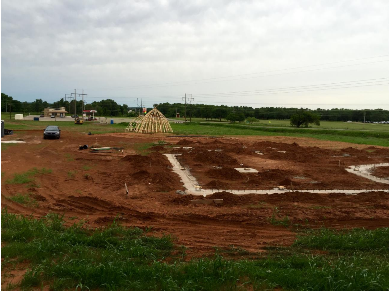
Construction Site east of Highway 281, facing south towards the Wichita Travel Plaza