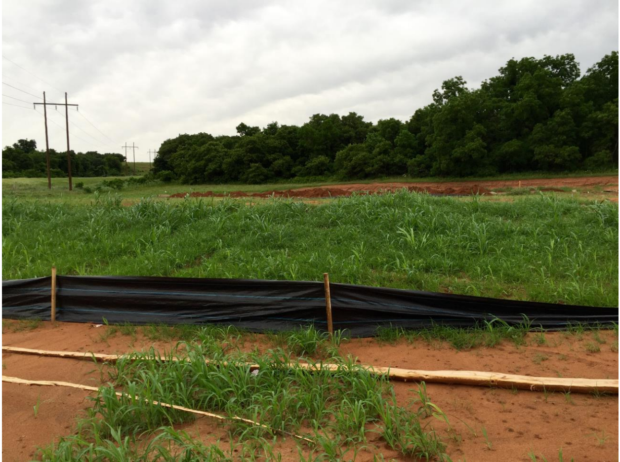
Construction Site showing elevated dirt pad, facing north