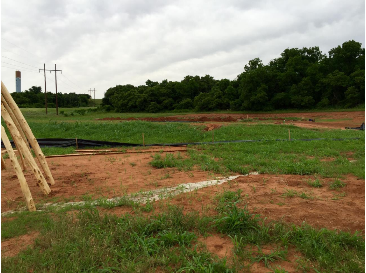
Construction Site showing elevated dirt pad, facing north