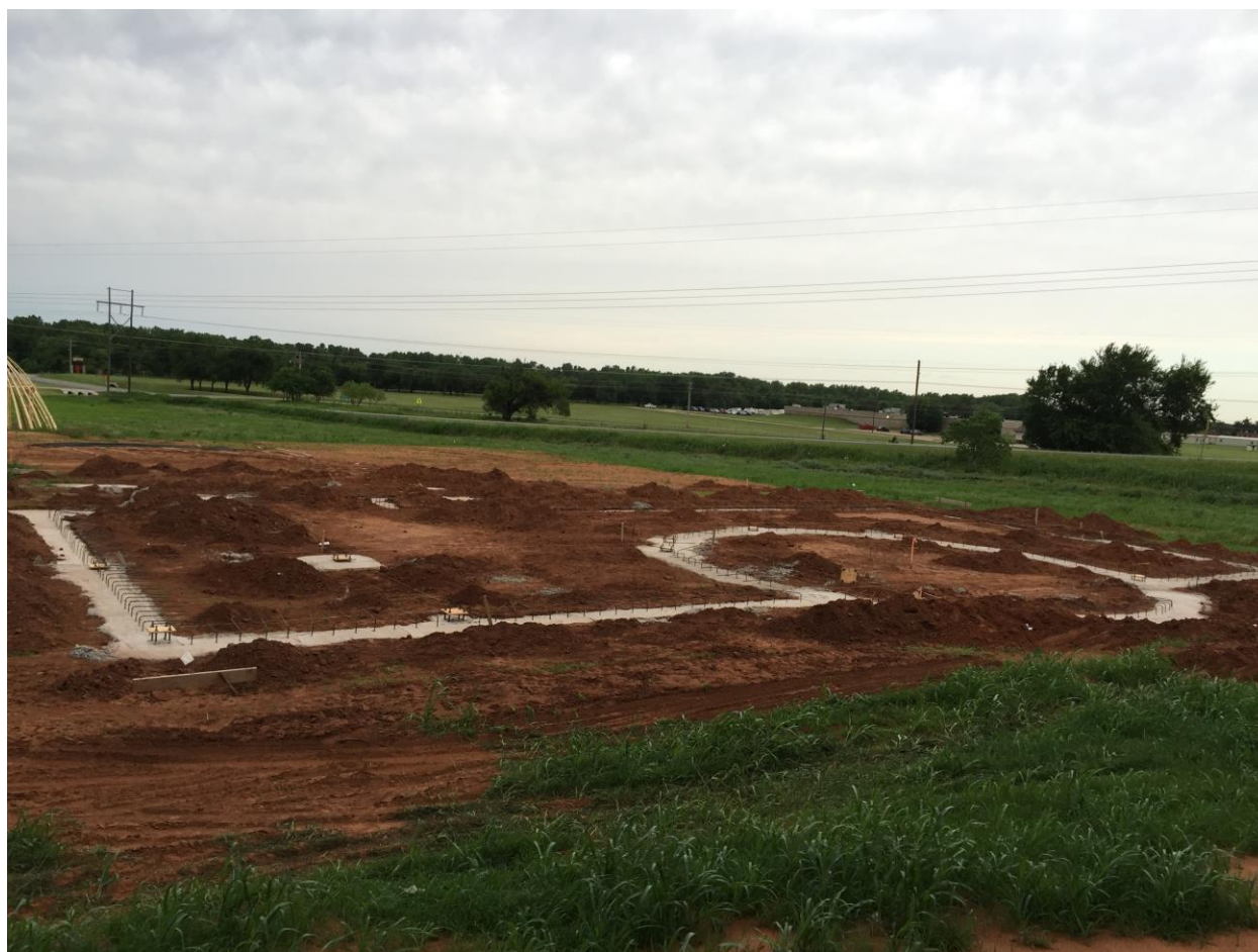
Construction Site of the Wichita History Center and poured Perimeter Slab Form, facing southwest