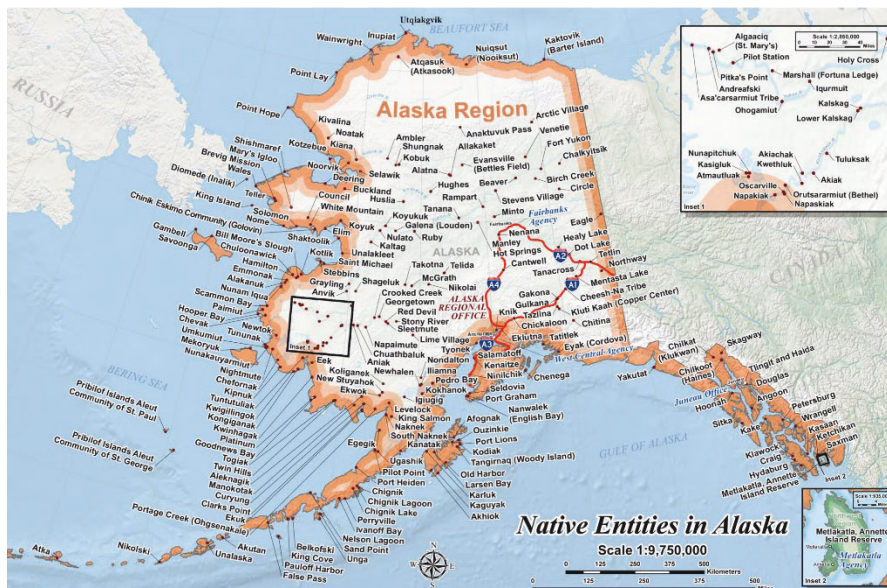
Fig. 1, Map, Native Entities in Alaska and Major Road System.