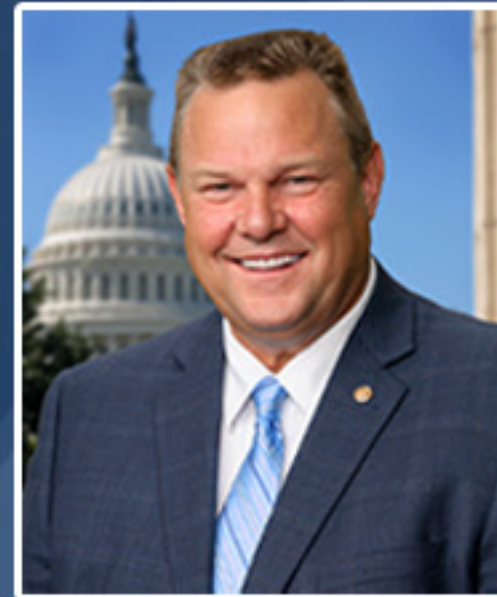
Sen. Jon Tester Montana