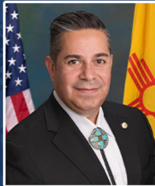
Sen. Ben Ray Luján New Mexico