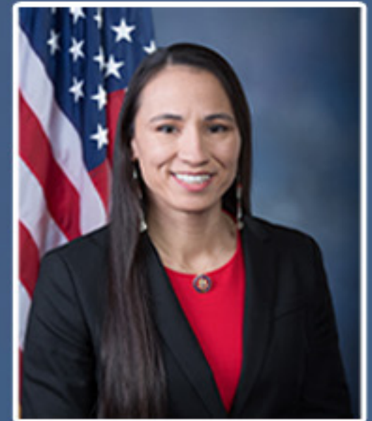
Rep. Sharice Davids Kansas