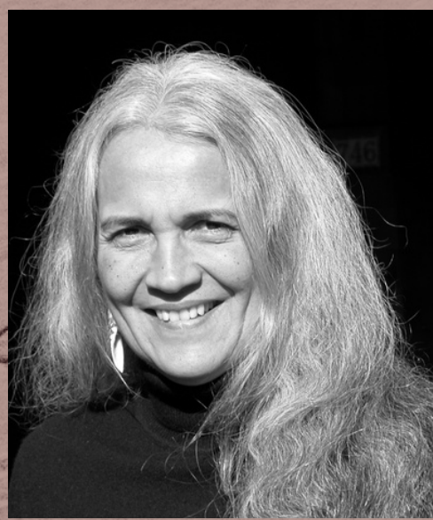
Hon. Abby Abinanti Chief Judge, Yurok Tribal Court California's first Native American female lawyer